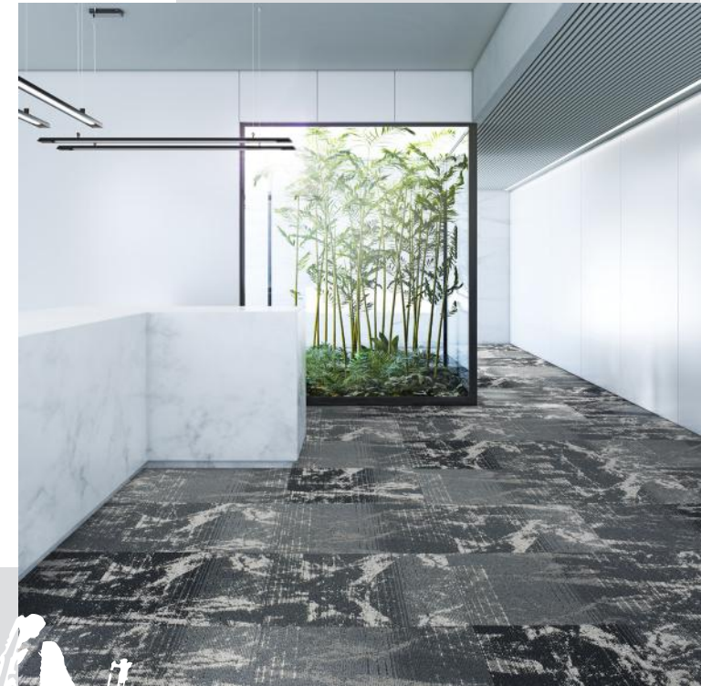
Dawn 57B, 57M, 93B, 93M