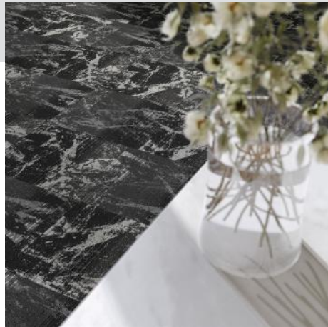
Dawn 96B, 96M