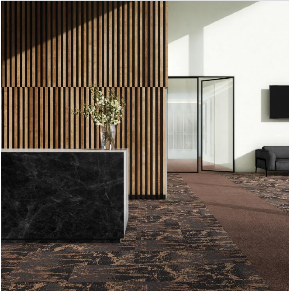
Dawn 82B, 82M & Gleam 306