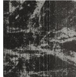
Bright: Dawn 96B